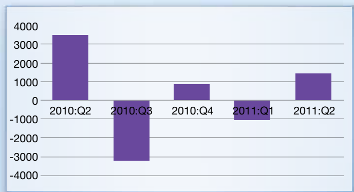
Figure 1. Central Gov't Fiscal Surplus/Deficit (TT$M)